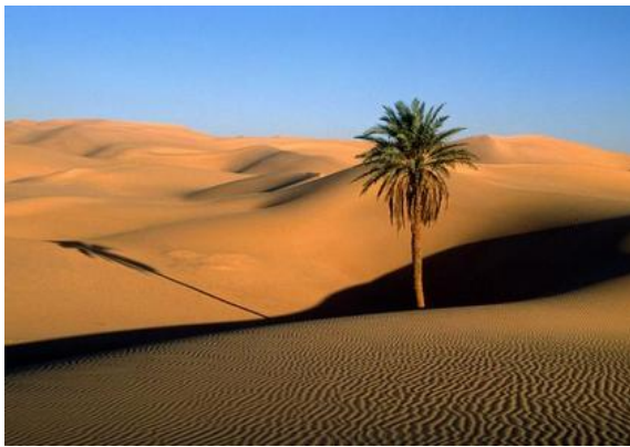
Fig. 3 (a) The Sahara desert.