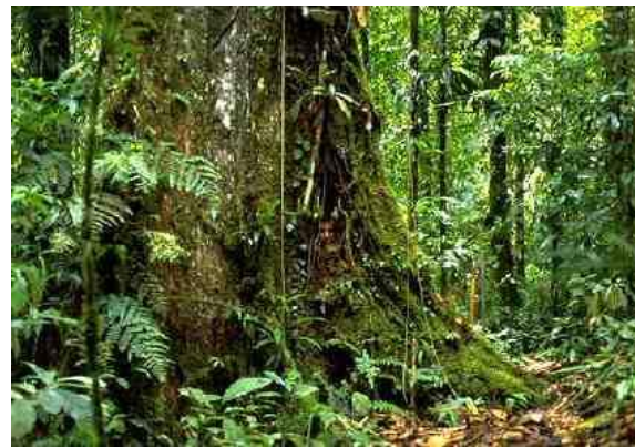
Fig. 3 (b) The Amazon rainforest.

The palm tree of the Sahara desert is able to tap the scant amount of soil moisture above the groundwater table and proceed with its physiological growth needs [Fig. 3 (a)]. Despite its apparent lushness, the Amazon rainforest has no other choice but to store the ecosystem's available nutrients within its abundant canopy and litter, to recycle them as appropriate [Fig. 3 (b)].