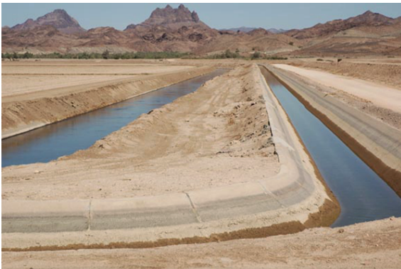
Fig. 8 (a) Irrigation and drainage canals, Wellton-Mohawk Irrigation District, Wellton, Arizona.