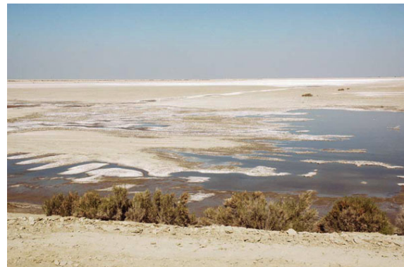
Fig. 8 (b) South evaporation pond, Tulare Lake Basin, Kings County, California.

Prior to the advent of irrigation, there were no extra salts to contend with. The system was referred to as dryland farming , or dryland agriculture , which relied solely on the water and moisture provided by Nature. Productivity was comparatively low, but water harvesting systems and other similar low-cost technologies could be implemented to reduce the difference between what Nature could provide and what humans could aspire to for economic reasons.